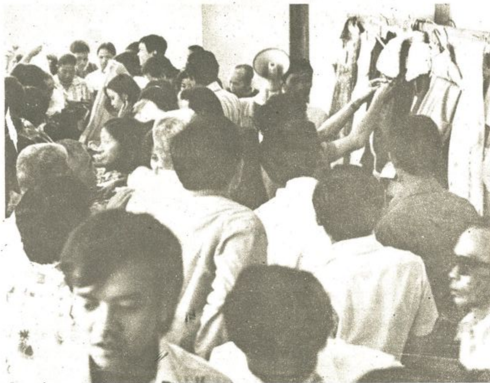
BARGAIN! BARGAIN! -- The Baguio Feast takes on a "fiesta" atmosphere as a crowd mills around goods for sale at a bargain.